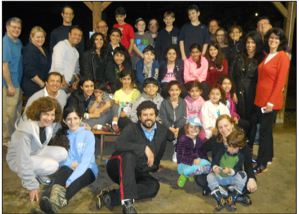
Temple Israel Vav students, parents, and staff attended a weekend retreat at Camp Ramah.